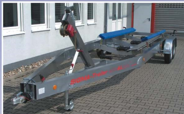
ST-3500/extrALight, motorboat version with plus-package

... with the extrALight diet for loosing the crucial pounds of "overweighted" trailer captains!