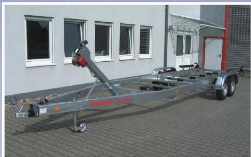
ST-3500/classic, motorboat version

Reliable and complete does the classic convince by rugged engineering and premium workmanship.