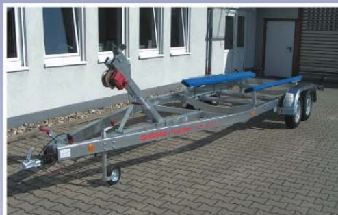
ST-2000/comfort, motorboat version

... but with the comfort you slip easy and perfekt even if Neptune is angry with you!